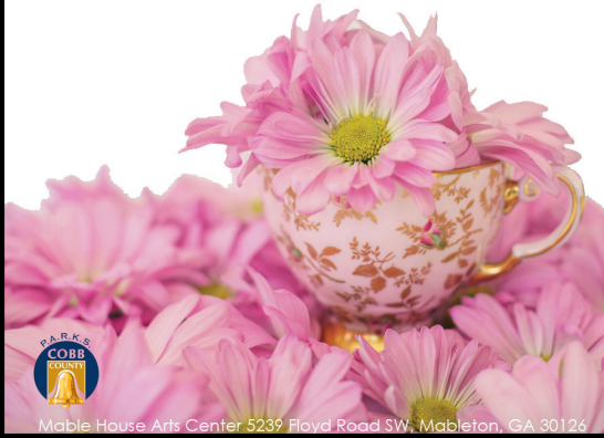
Table of 4/$50 6/$75 8/$100 Must have reservation. Call 770-819-3285 to reserve your seats starting October 16th